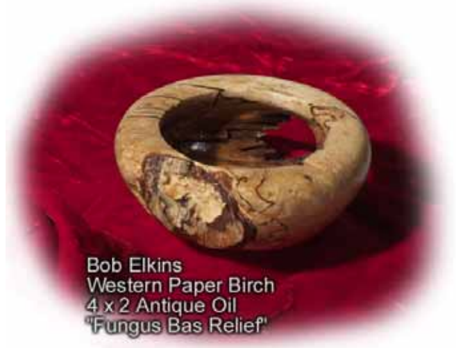
Bob Elkins Western Paper Birch 4 x 2 Antique Oil "Fungus Bas Relief"