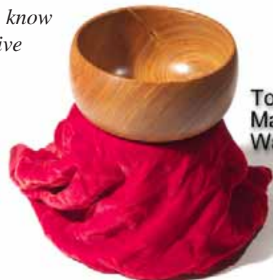
Tom Berkley Mara - 6" Walnut Oil