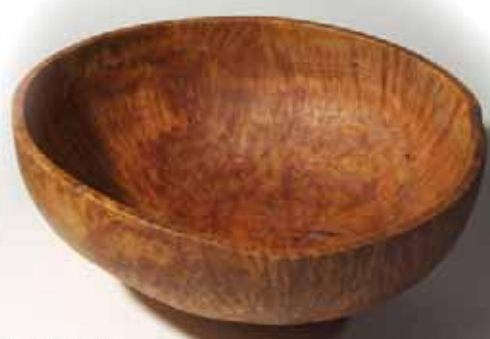
Vern Tator Madrona Burl 16 x 8 Mix of Walnut Oil, Thinner & Ben Matte