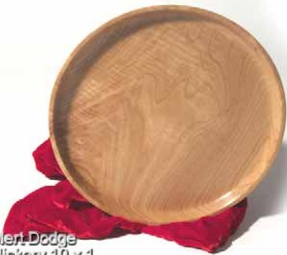
Meri Dodge Hickory 10 x 1 Wipe-on Urethane