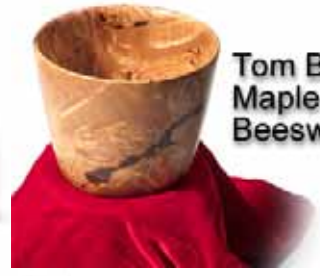
Tom Berkley Maple Burl 5" Beeswax