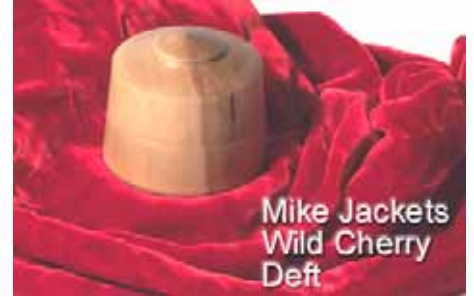
Mike Jackets Wild Cherry Deft