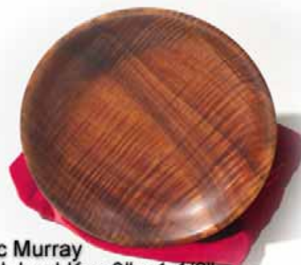
Chic Murray Big Island Koa 8" x 1-1/2" Danish Oil