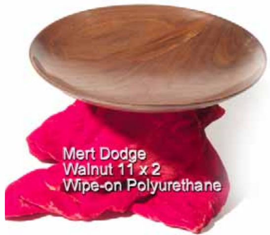
Mert Dodge Walnut 11 x 2 Wipe-on Polyurethane