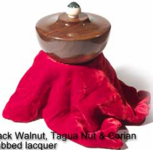
Black Walnut, Tagua Nut & Gorian Rubbed lacquer

Unfortunately I was not able to read the name on this delightful piece. Would the author please let me know at our April meeting so I can give credit. Thanks.