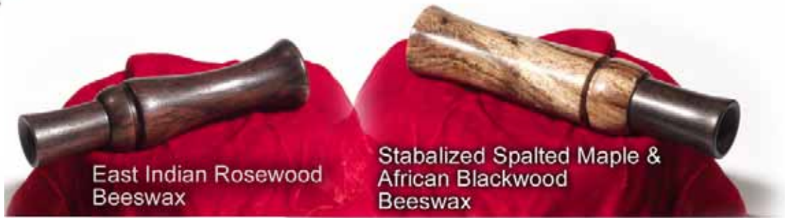
East Indian Rosewood Beeswax