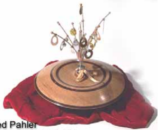
Fred Pahler Buffed Oak 9 x 2-1/2 Interlace Inlay