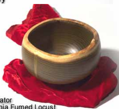
Vern Tator Ammonia Fumed Locust 6" x 4" - Lacquer