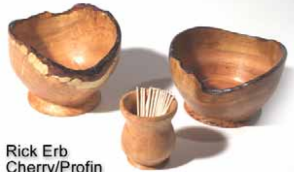
Rick Erb Cherry/Profin

Masonite painted dark blue with copper leaf & silver leaf with a sodium sulfite patina.