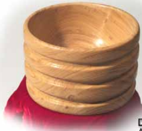
Dick Rice Ash