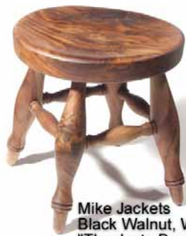
Mike Jackets Black Walnut, Walnut Oil "Thanks to Bonnie Klein!"