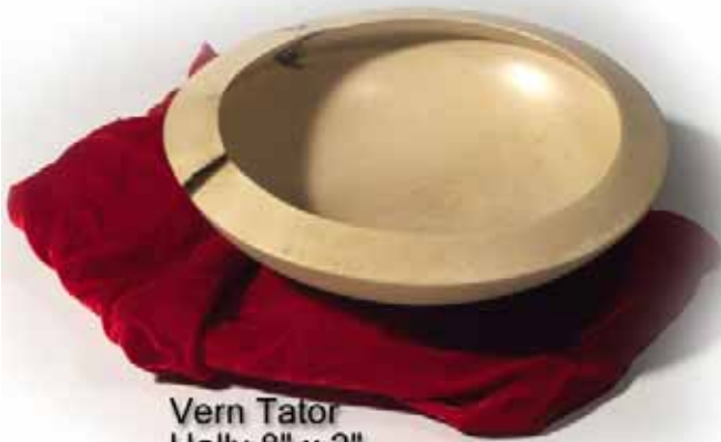
Vern Tator Holly 8" x 2" Lacquer