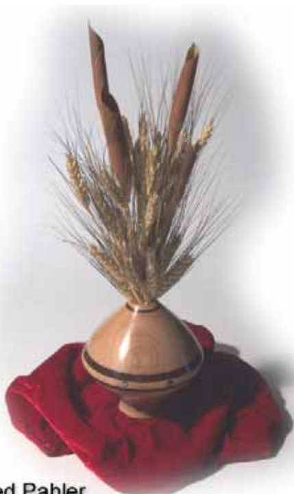
Fred Pahler 6" x 5" Birch Buffed finish with Inlace accents