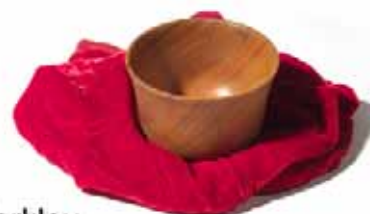
Tom Berkley 5" - Walnut Oil/Renaissance Wax