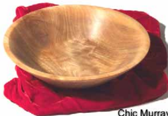
Chic Murray 9" x 3" Cinnamon Danish Oil