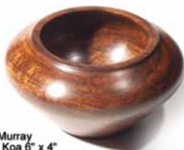
Chic Murray Oahu Koa 6" x 4" Danish Oil