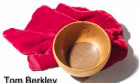
Tom Berkley Juniper/Black Walnut Renaissance Wax