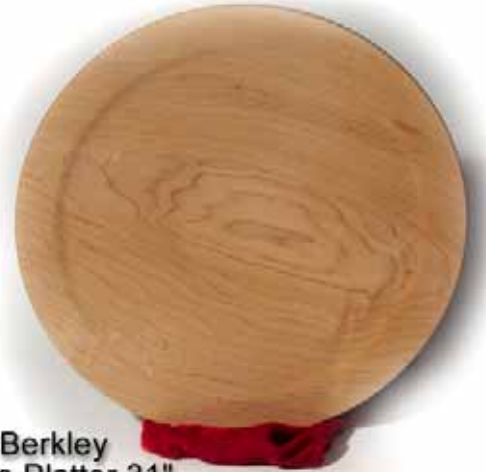
Tom Berkley Maple Platter 31" Walnut Oil/Renaissance Wax